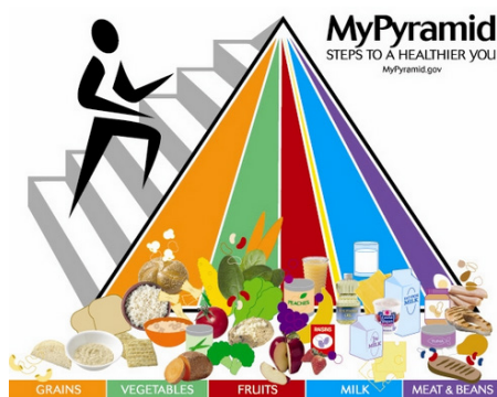
Figure Two: USDA Food Pyramid 2005

Similarly, the U.S. government has simplified its food guide graphics over the years from the confusing diagram in Figure Two to the clear message in Figure Three.